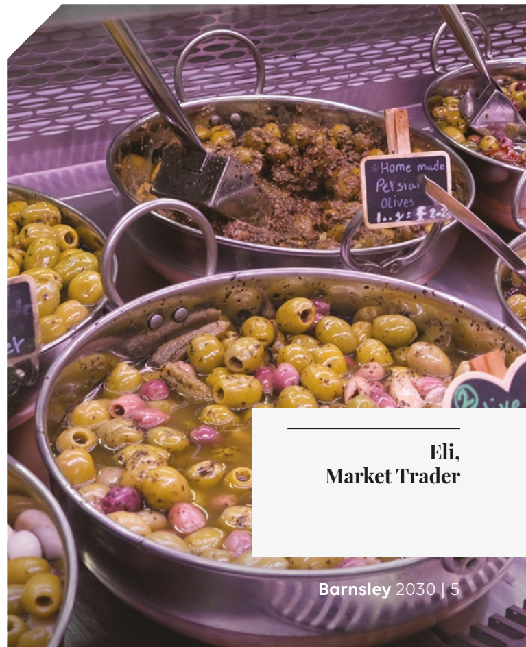
Eli, Market Trader

"The market is a valuable platform for small businesses. It's a supportive and nurturing environment."