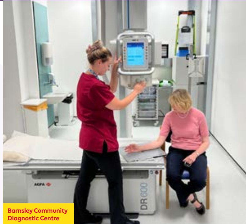
Barnsley Community Diagnostic Centre

We'll continue in collaboration with our partners to implement local public health initiatives across the borough to tackle local health inequalities, like our How's Thi Ticker and our involvement in the Yorkshire Smokefree Barnsley campaign.