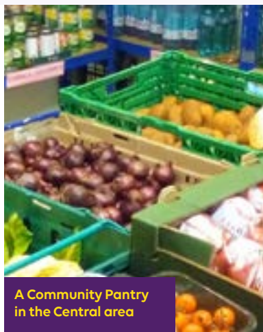
A Community Pantry in the Central area