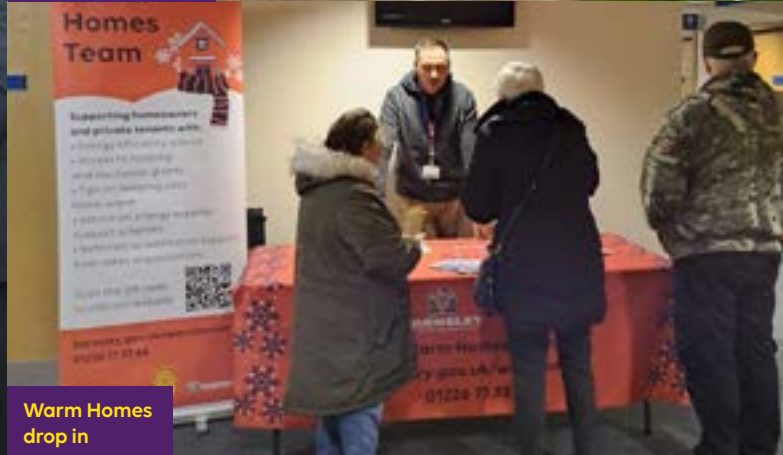
Warm Homes drop in