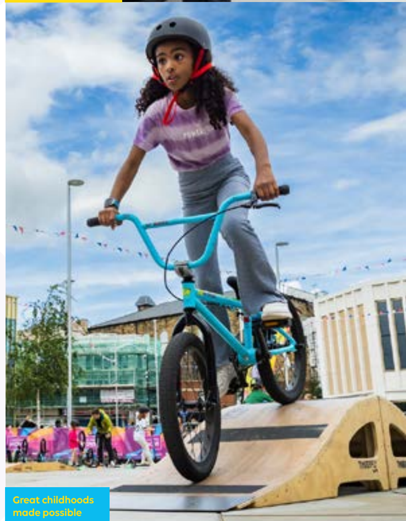
Great childhoods made possible

The development of the Barnsley Youth Zone will provide a safe and aspirational place for young people. Hosting first class facilities in sports, arts, performance and enterprise. Skilled youth workers will offer over 20 different activities to try and will support young people to realise their own aims and achievements. Located in an exciting new building close to the train station and bus interchange it will be accessible to young people across the borough.