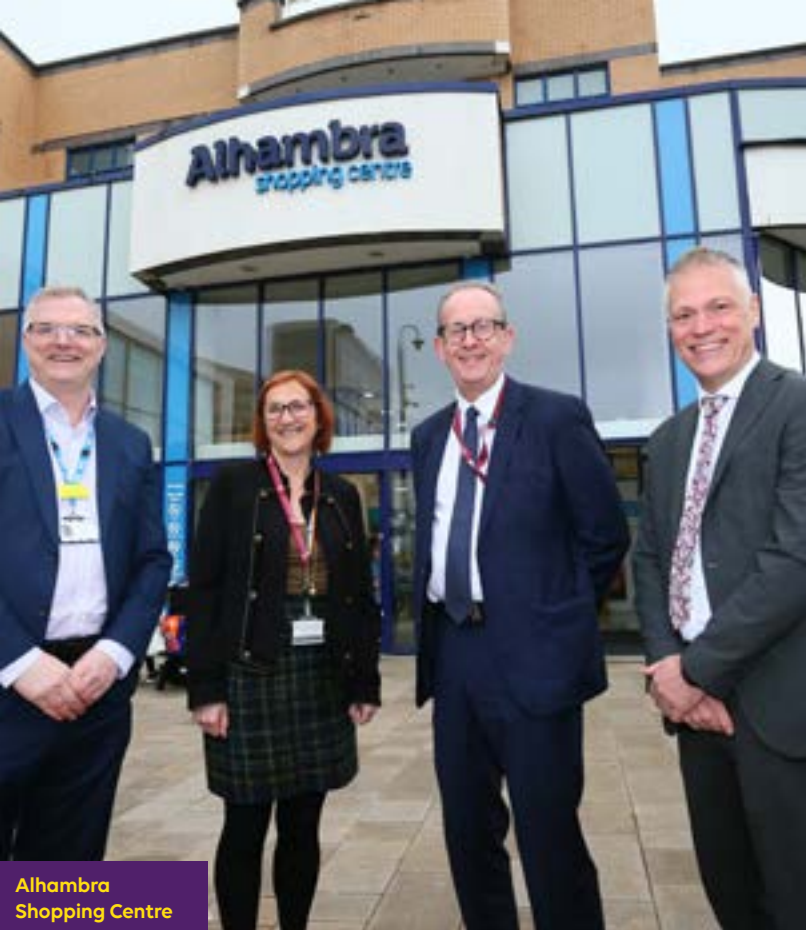
Alhambra Shopping Centre