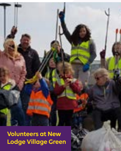
Volunteers at New Lodge Village Green