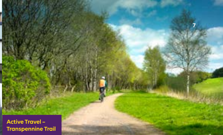
Active Travel – Transpennine Trail