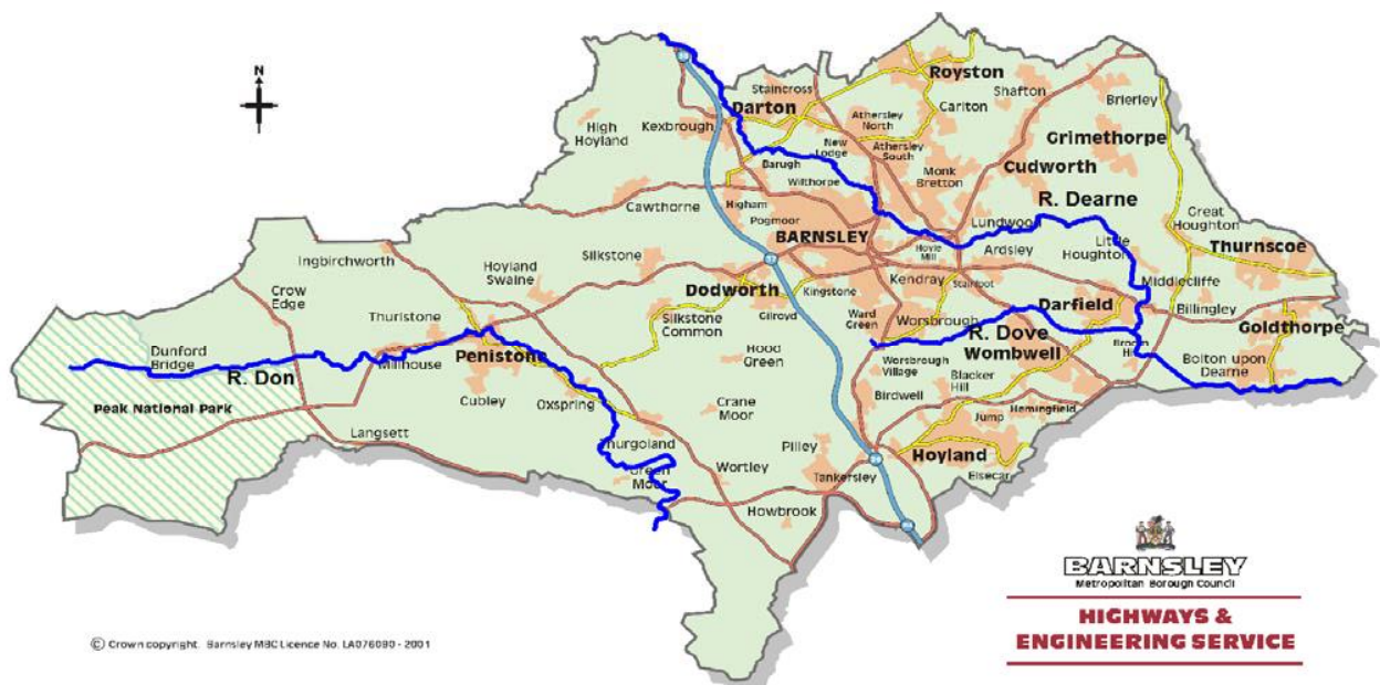
Figure 1 - Barnsley MBC Administrative Area

The map below shows the extent of the BMBC are and the main rivers that drain the district.